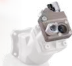
2012 BY-PASS VALVE/SBP