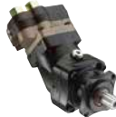
2008 SCPD 56/26